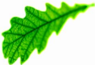
on a leaf

3. Where does the bird put the twigs in its beak?